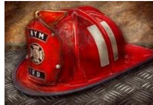
Firefighters who have left the service