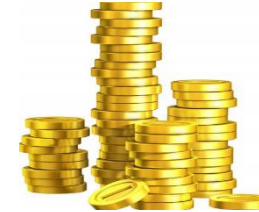
Firefighters who have left the service and are in receipt of a pension