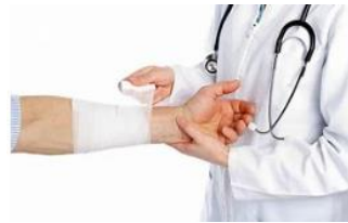
Firefighters who have left the service and in receipt of ill-health benefits (or potential ill health cases)