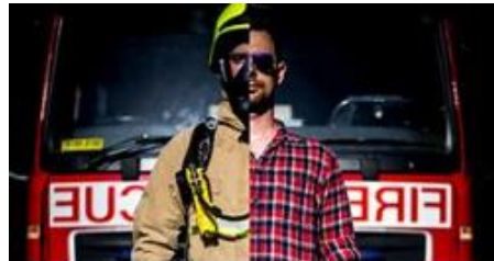
Those employed as retained Firefighters between 1 July 2000 and 5 April 2006